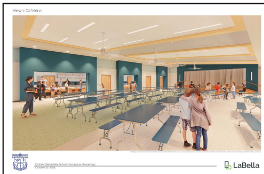
Ginther Cafeteria Rendering