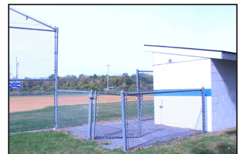
BHS Baseball Fencing