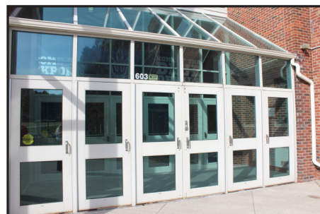
Renovate OMS Entrance Doors