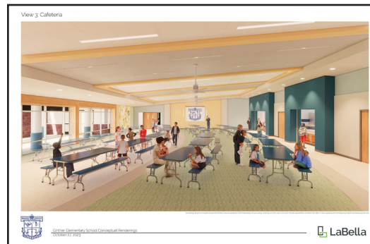
Ginther Cafeteria Rendering